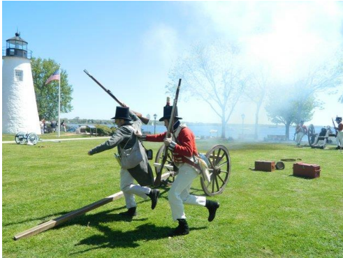
War of 1812 weekend

Check out our blog at concordpointlighthouse.blogspot.com to see more pictures from the War of 1812 weekend.