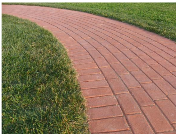
Legacy Walkway ready for your personalized bricks

www.concordpointlighthouse.org for Patriot or Wedding brick ordering information