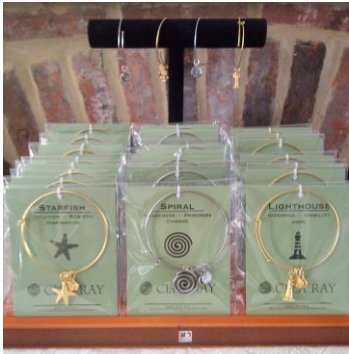
Clea Ray Nautical charm bracelets