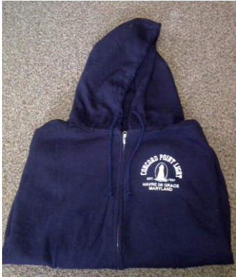
Zip Hoodies – It will get cold again. Warm up with this Concord Point hoodie.

Remember – all proceeds go towards operating and maintaining the Lighthouse and Keeper’s House Museum.