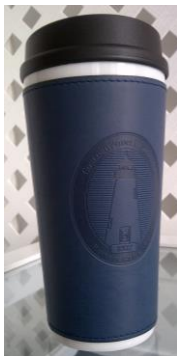
Concord Point ceramic travel mugs – take the lighthouse with you everywhere you go!